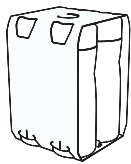
Cluster-Pak® over the top