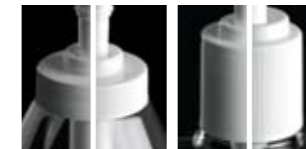
33-400 (smooth or ribbed) 33-415 (smooth or ribbed)