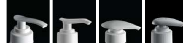
stylized saddle palmtop satin