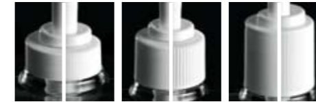
28-400 (smooth or ribbed) 28-410 (smooth or ribbed) 28-415 (smooth or ribbed)