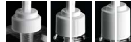
24-400 (ribbed) 24-410 (smooth or ribbed) 24-415 (smooth or ribbed)