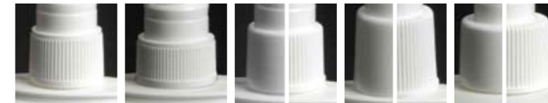
GL 20 (ribbed)